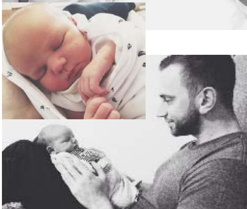
PROUD PAPPA ADMIRING HIS NEW SON