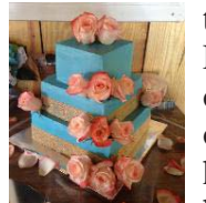
"THERE YOU GO..."

The reception consisted of a delicious meal of prime rib and Chicken Cordon Bleu and all the trimmings.