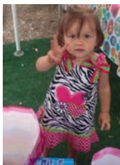
"I AM THIS MANY NOW"