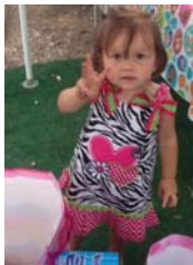
"I AM THIS MANY NOW"