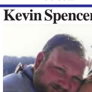
"THERE YOU GO..."

From my point of view, everyone seemed to have a great time and the comments I heard were "such a beautiful wedding".