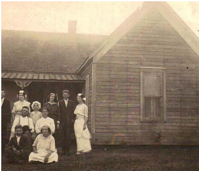
HERE IS ANOTHER ONE