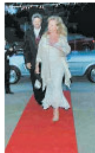
“HERE SHE COMES”