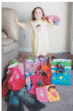
“IT’S ALL MINE”