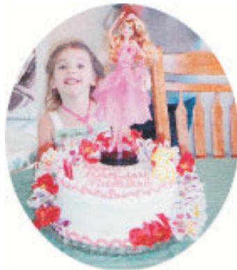
“I WANT MY CAKE AND EAT IT TOO”