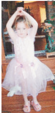
“LET THE PARTY BEGIN”