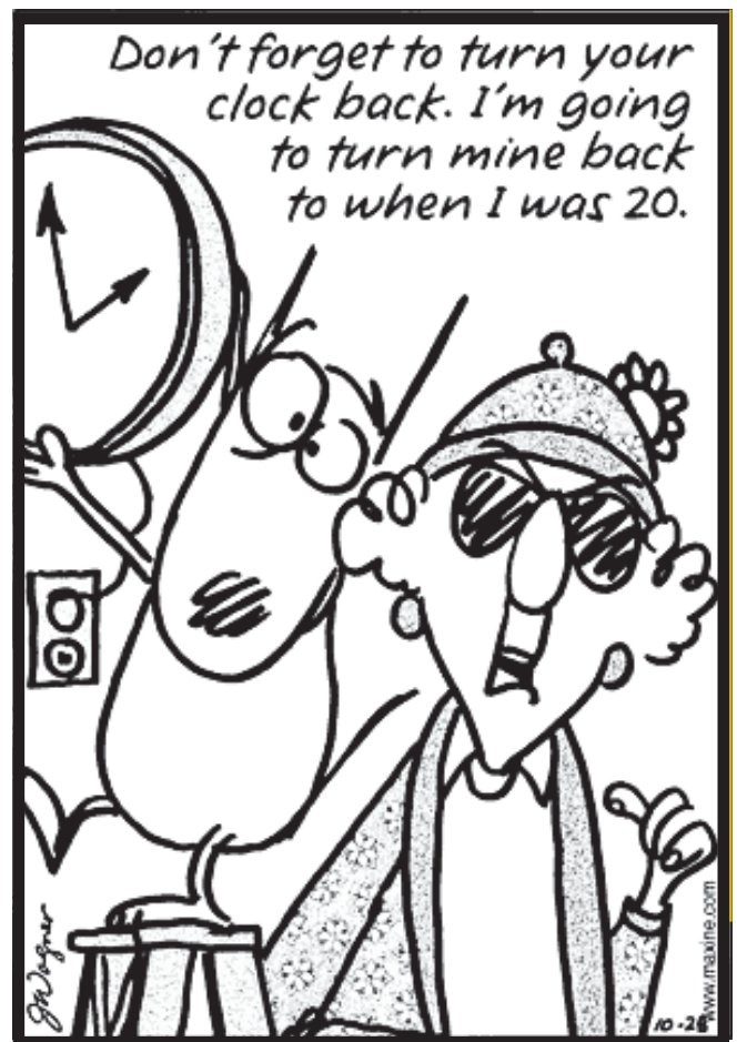
My sentiments exactly!! ...Leroy