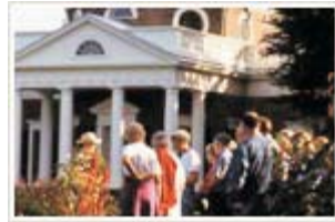
Monticello, the home of Thomas Jefferson

Almost from the beginning of my Family Research Project, I have been aware of the DEDMON CENTER at Radford University in Radford, VA.