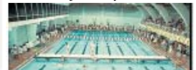
I can only imagine how popular the indoor pool at the Center could be or is. A search on the internet will reveal almost every sport is conducted at the DEDMON CENTER during the year....