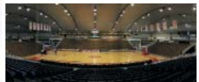
Here is an inside shot of the DEDMON CENTER. As you can tell the Center is a very versatile place. It also has an outside field that is used for many events.