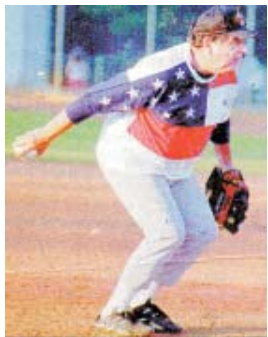
Yours truly on the mound