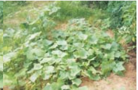
CUCUMBERS ON THE VINE