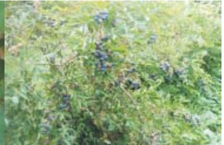
NO THRILL ON THIS BLUE BERRY HILL