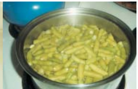
WHAT'S FOR SUPPER, GRANDPA?