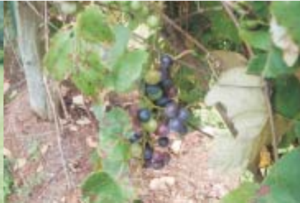
A CLOSE UP VIEW OF GRAPES