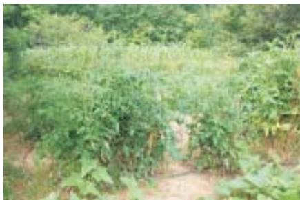
RED RIPE TOMATOES