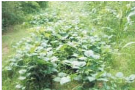
PRETTY VINES, BUT NO PEAS YET