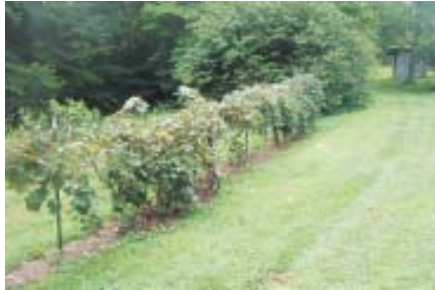
A VIEW OF THE GRAPE VINES

Last month I showed you pictures of my yard and as promised I am including some pictures of my garden in this month's DEDMON CONNECTION. As you can see, I have had to battle the weeds.