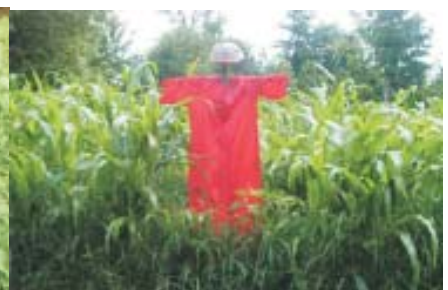
AN ALABAMA CAP WILL SCARE CROWS