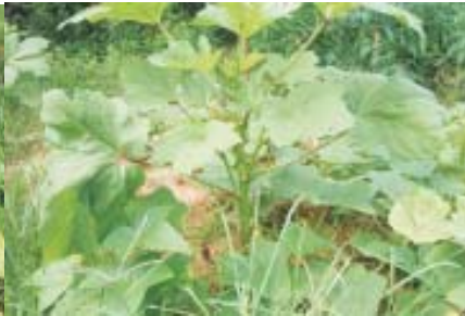
ONE OF MY FAVORITES.. OKRA