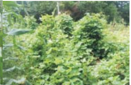
KENTUCKY WONDER POLE BEANS