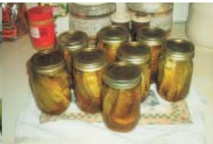
NOW WE ARE IN A PICKLE