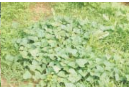
HARD TO BEAT SWEET 'TATERS