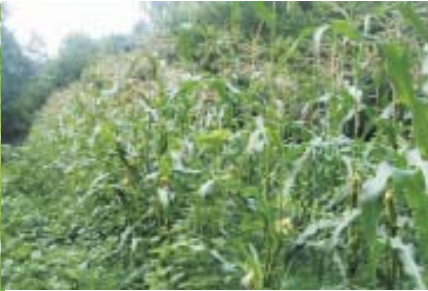
CORN ON THE COB IS HARD TO BEAT