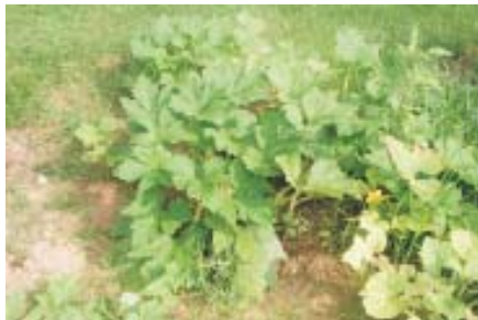
IN THE SOUTH IT'S SQUASH