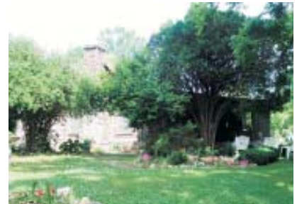
THIS SHOWS THE POND IN RELATION TO THE HOUSE. YOU CAN SEE THE LOG PORTION OF THE HOUSE THROUGH THE