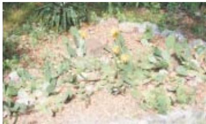
THE CACTUS ARE REALLY BEAUTIFUL WHEN THEY ARE ALL IN FULL BLOOM.