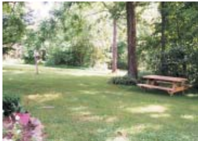
STANDING ON THE NORTH SIDE OF THE HOUSE AND LOOKING ACROSS THE FRONT YARD. THE HOUSE IS TO THE LEFT..