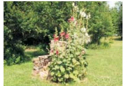
WE ARE ON THE SOUTH SIDE WITH OUR BACK TO THE HOUSE, LOOKING EAST.