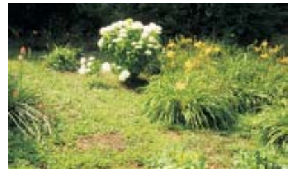
PLEASE DON'T ASK ME TO IDENTIFY ALL THE FLOWERS. MAYBE NEXT YEAR...