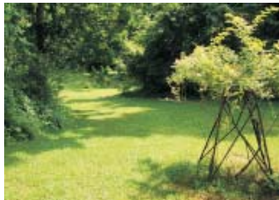
FROM ALMOST THE SAME SPOT, BUT LOOKING WEST TOWARD THE MOUNTAIN.