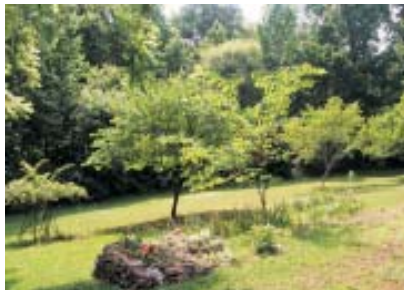
A VIEW WITH MY BACK TO THE HOUSE LOOKING NORTH. STILL THE FRONT YARD.