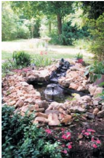
THE PICTURE DOES NOT DO JUSTICE TO THE LITTLE LILY POND. ALL THE ROCKS ACTUALLY CAME OUT OF THE HOLE.