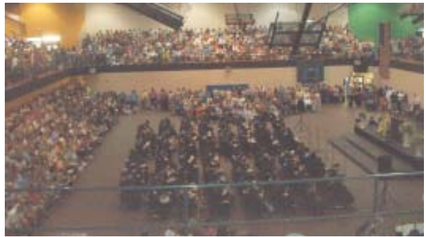
THE GRADUATES OF SPRINGFIELD HIGH Almost 200 seniors are anxiously awaiting their diplomas as they say good-bye to High School.