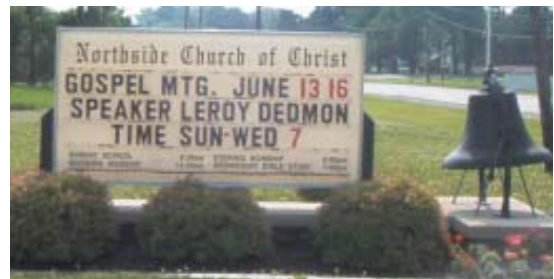
THE SIGN IN FRONT OF THE BUILDING AT BISMARCK, IL YOU CAN SEE THE FEATURED SPEAKER IS NONE OTHER THAN “YOURS TRULY”. I REALLY LIKED THE BELL.....