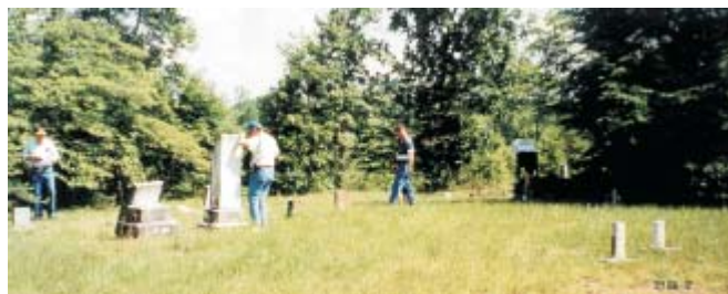
Dedmon Cemetery in Catoosa, County, GA.