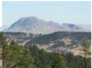
(Lincoln County, WY)

For the other one we have to leave the "Lower 48" and journey to Alaska.in the Fairbanks area there is also a Deadman Lake and Deadman Bay. There are some Deadman Mountains in Canada and Russia and other places designated Dedman, such as Deadman Flats, Deadman Lake, and Deadman Pass. Some of these if not all are named for the treacherous terrain and known as dangerous places such as Deadman curve.