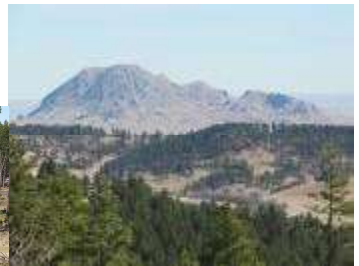
(Lincoln County, WY)

For the other one we have to leave the "Lower 48" and journey to Alaska. in the Fairbanks area there is also a Deadman Lake and Deadman Bay. There are some Deadman Mountains in Canada and Russia and other places designated Dedman, such as Deadman Flats, Deadman Lake, and Deadman Pass. Some of these if not all are named for the treacherous terrain and known as dangerous places such as Deadman curve.