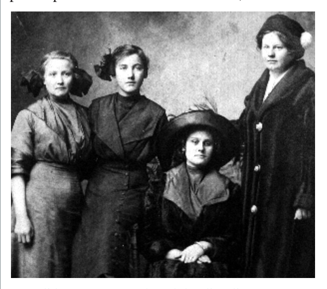
SOME DEDMON COUSINS - 1911

I have several pictures that have been sent to me through the years, but I have lost a lot of my email which contained the information. If any of you have more information concerning these photos, please let me know ASAP.... If you have some photos (old or new) that you would like to see published in future issues of the DEDMON CONNECTION, just send them to me. The more participation we have in this effort, the better it will be.