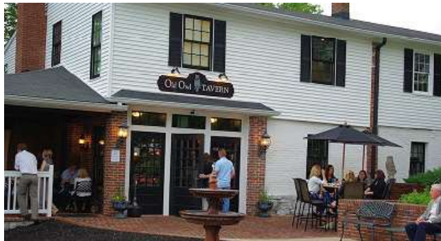
Old Owl Tavern and Owl's Nest Lounge.