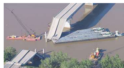
Collapsed I-40 Bridge, near Webbers Falls, Sequoyah County, OK -- May 31, 2002