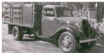
1936 V-8 FORD TRUCK