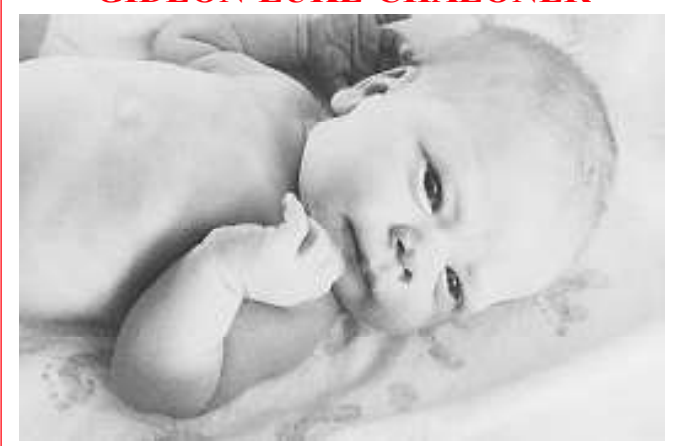
Born July 18, 2016 2:36 pm - 8lbs 1oz....21" long!!