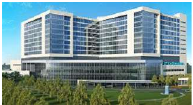
William P. Clements Jr. University Hospital