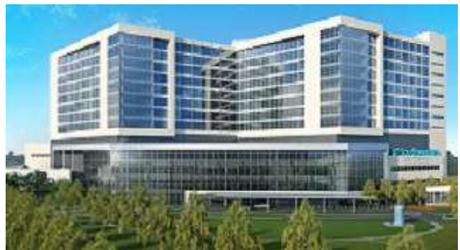
William P. Clements Jr. University Hospital