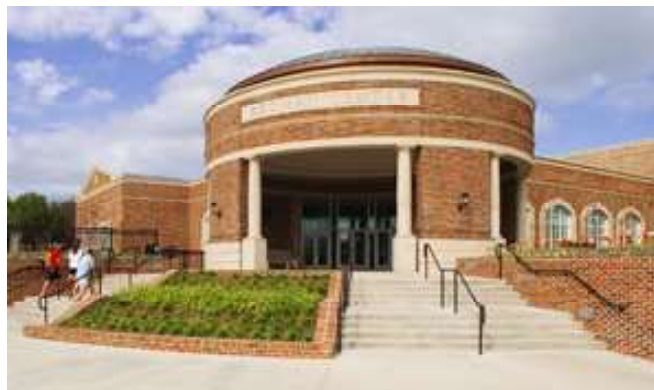
DEDMAN CENTER FOR LIFETIME SPORTS AT SMU