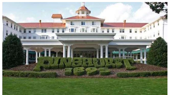
Pinehurst Resort & Country Club continued on page 6