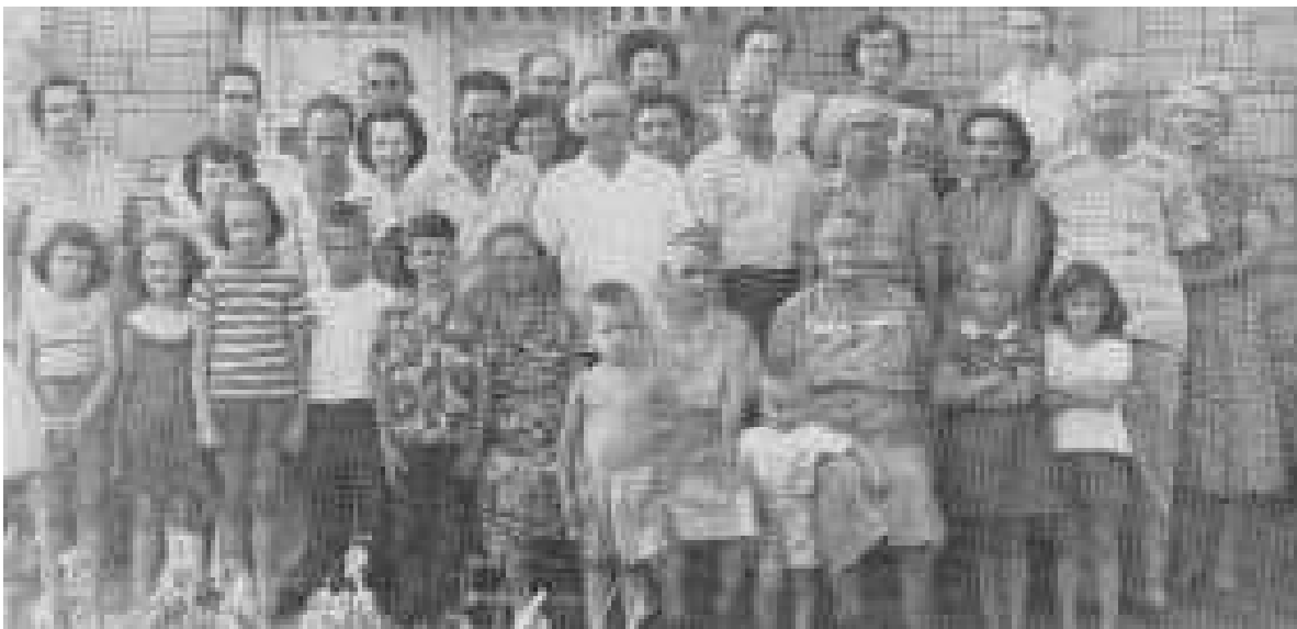
TAKEN AT A DEADMOND FAMILY REUNION