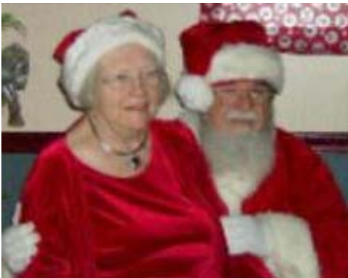
SANTA AND MRS. CLAUS