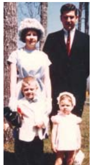
OUR FAMILY EASTER 1965

We had a badminton court in our back yard and also a large garden plot. We had some very good gardens and supplied vegetables to several of the members of the congregation.