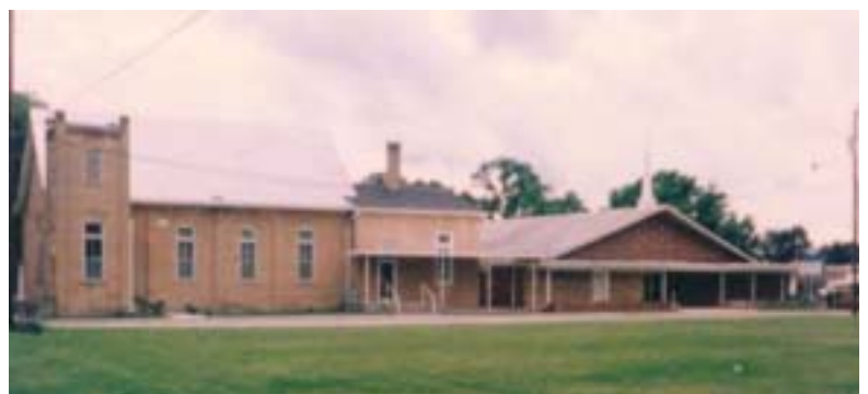
THE NEW BUILDING AT MORRISON, ON THE RIGHT, WAS BUILT IN 1964. THE OLD BUILDING, ON THE LEFT, IS NOW THE FELLOWSHIP HALL AND HAS THE BELL TOWER

Morrison built a new church building in 1964 adjoining the old building. The old building was built in the '30s and was an attractive structure. It had been remolded and contained the fellowship hall and some classrooms. There was a bell tower and the bell was rung each Sunday morning. You could hear the chimes all over town. Across the road was a vacant lot and it provided the neighborhood children an excellent place to play. Leroy and I would often play baseball with them.