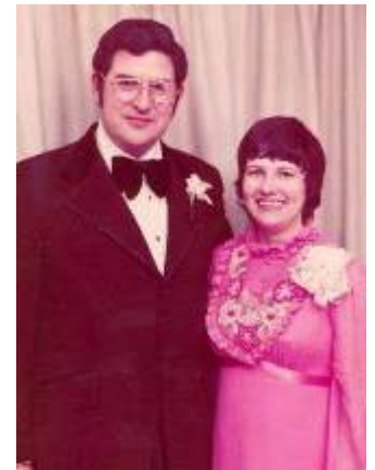
...NOW YOU DON'T!