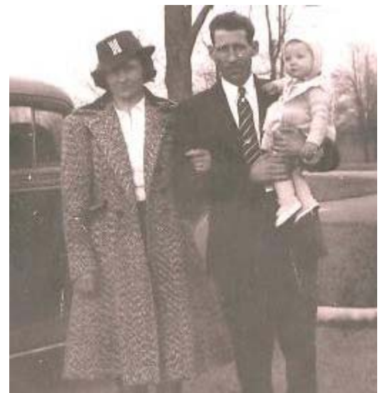
ME, DADDY AND MOTHER