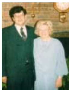
JUST THE TWO OF US

The church grew while we were at Springfield, in spite of a large number of deaths and folks moving away. There were about 200 in present the day we left that was not there when we arrived. The worship attendance