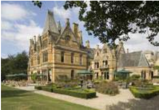
ETTINGTON PARK HAS BEEN IN THE SHIRLEY FAMILY SINCE BEFORE THE NORMAN

The family of Shirley is of great antiquity of an ancient Saxon line long before the Norman Conquest as ancient manuscripts, documents, Parish registers and records prove. The Norman Conquest began in 1066 with the invasion of the Kingdom of England by William the Conqueror (Duke of Normandy) it was a pivotal event in