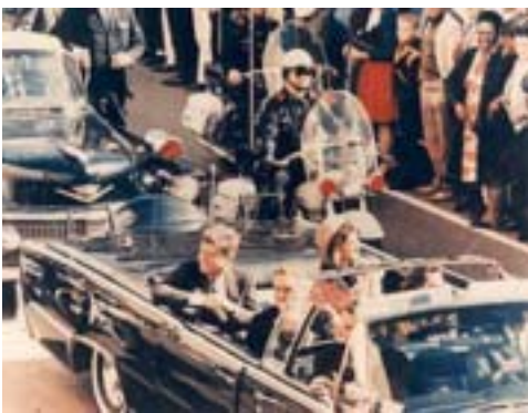
PRESIDENT JFK AND WIFE, JACQUELINE, WITH TEXAS GOVERNOR CONNALLY SHORTLY BEFORE HIS ASSASSINATION