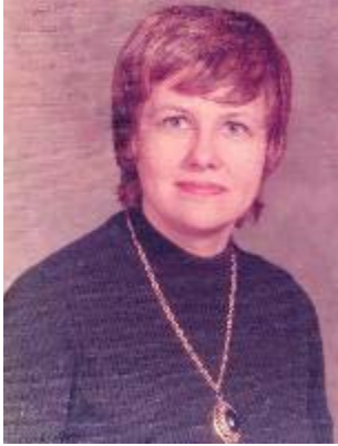
BACK TO BROWN.....