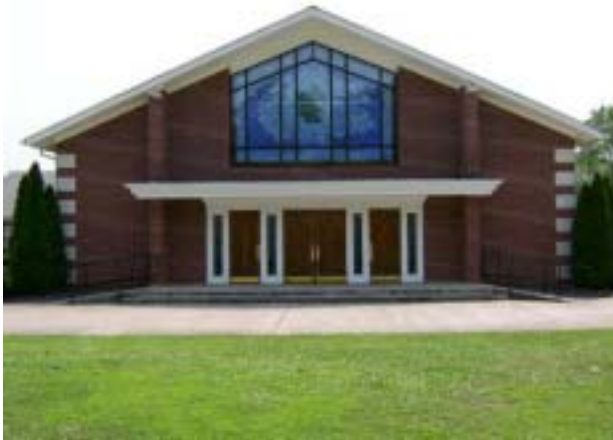
650 ALABAMA AVENUE, BREMEN, GA

In September of 1985 we moved to Bremen, GA. The church at Bremen agreed to pay our moving expense, so Leroy and Ed decided to do it themselves, in order to save the church money and make some for themselves. It took two 24' U-Haul trucks plus a few trips with a pick-up truck. In between the trips with the U-Haul, Leroy,