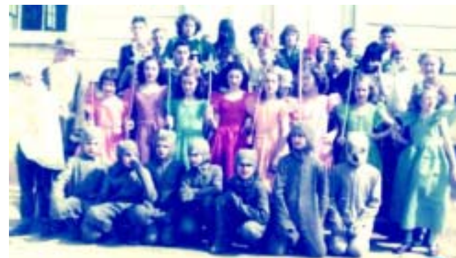
IN THE FIFTH GRADE I WAS IN A PROGRAM. I AM ON THE RIGHT END IN MY BLUE PAPER DRESS.