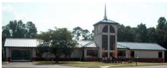
THE CHURCH BUILDING AT WOODSTOCK GETS A "FACE LIFT"