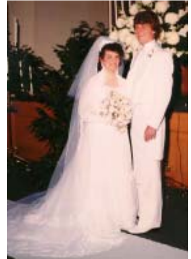
THE BRIDE AND GROOM