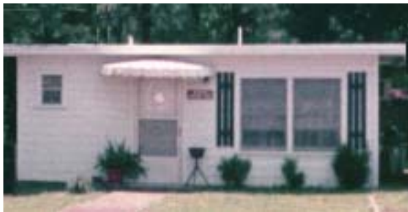
THE LITTLE HOUSE ON WALKER STREET WAS FACING THE SCHOOL AND MADE IT CONVENIENT TO SUBSTITUTE TEACH.