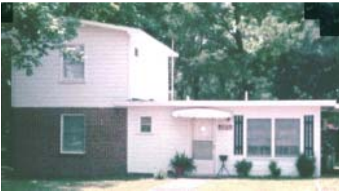
THE FIRST HOUSE WE LIVED IN AT GURLEY. IT HAD BEEN REMODELED WITH THE TWO STORY ADDITION ON THE LEFT END.