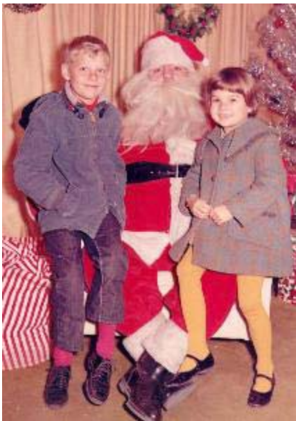
SANTA AGAIN!!! - 1968