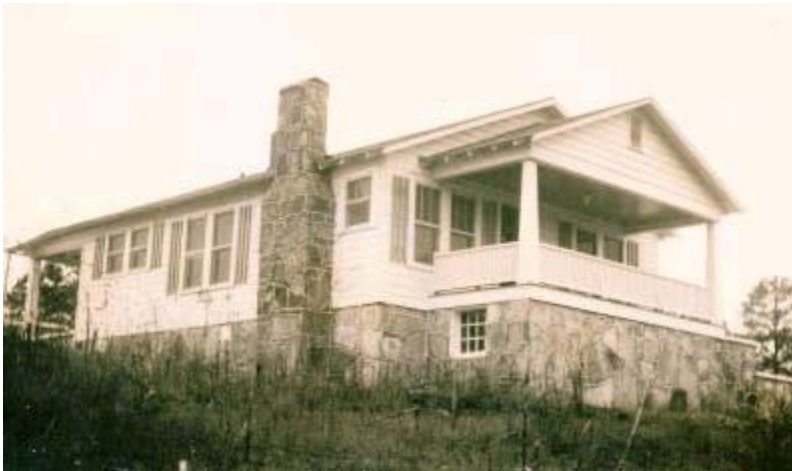
OUR HOUSE ON VANDIVER ROAD, FACING MISSION RIDGE ROAD, NEAR WALLACEVILLE