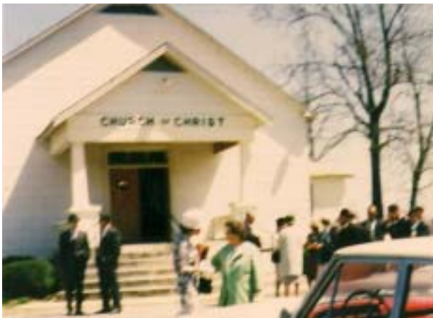
THE NEW UNION CHURCH BUILDING - 1964