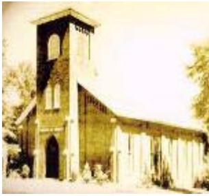
THE ORIGINAL CHURCH BUILDING EARLY 1900

The Springfield church was established in the early 1900's, and they purchased the first building from the Baptist church. There were a lot of older members that were part of the congregation from the start. Of course, there were a lot of custom and tradition. Around 1957