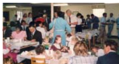
A GOOD CROWD IN ATTENDANCE