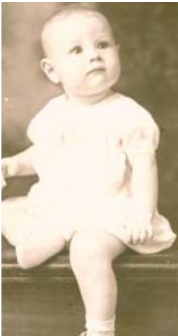
THIS IS ME AT 1 YEAR OLD