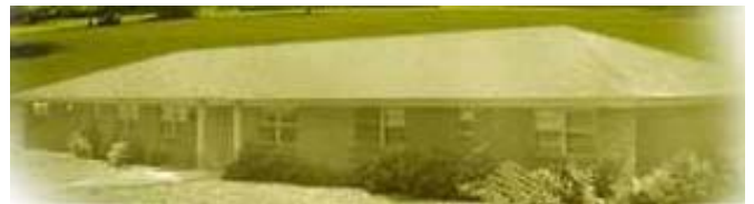
SENIOR BOYS COTTAGE, CHILDHAVEN - 1964