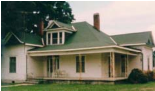
THE PREACHER'S HOUSE AT MORRISON