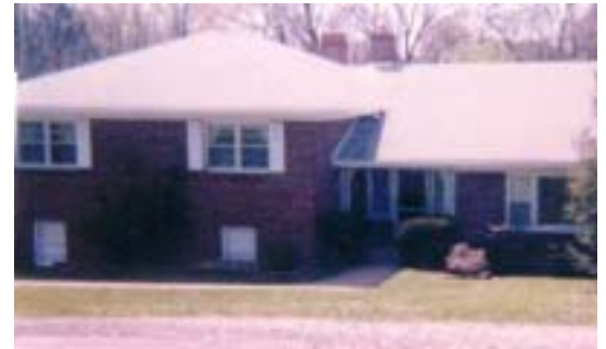
PREACHER’S HOUSE AT SPRINGFIELD 114 N. SEQUOIA DRIVE

The Preacher’s house was located about one mile from the church building at 114 N. Sequoia Drive. It was a large split level house with four levels. The top level contained four bedrooms and two baths. The next level down was the living room/dining room, foyer and kitchen. The ground level was a den, bathroom and garage. Then the fourth level was a basement. We converted the garage into a play room for the kids. It had a large yard with the back yard terraced and steep. It was very difficult to mow. The house was below street level and in a curve. There was a large pyracantha bush on the front of the house that had to be trimmed and trained. In the back yard we had a beautiful rose bush. Leroy had to spend at least one day a week in the yard. The Springfield congregation was by far larger that Leroy had ever thought he would preach for. It was considered to be in the range of 500 members. It was very organized and provided us with a lot of opportunities and training that proved helpful in our future congregations.