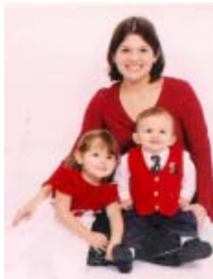
CARRIE AND BABIES