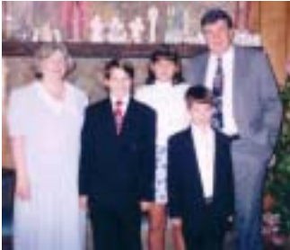
GRANDCHILDREN - 1998