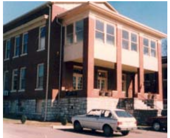
SIMONTON'S CLINIC CHICKAMAUGA, GA