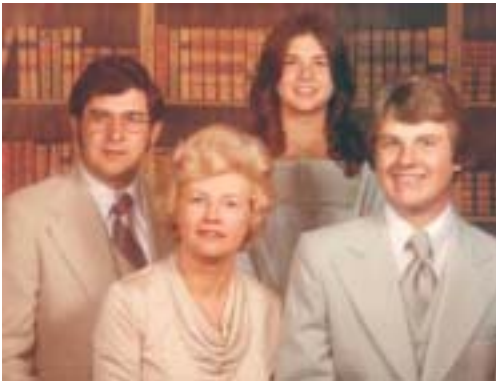
FAMILY - 1979