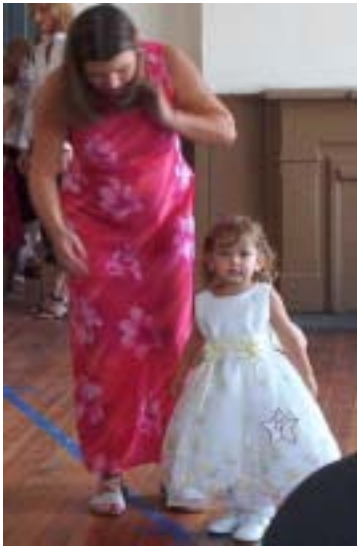
QUEEN FOR A DAY - 2003