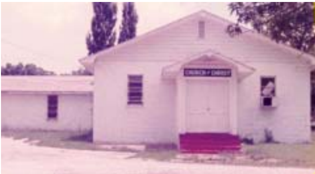
THE CHURCH BUILDING AT KEEL MOUNTAIN. THE CHURCH NO LONGER MEETS, BUT THE BUILDING STILL STANDS.