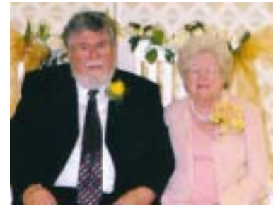
HERE WE ARE 50 YRS LATER