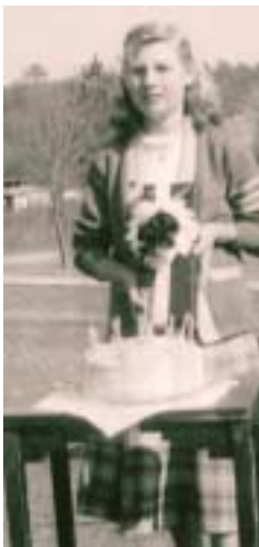
MY 13TH BIRTHDAY

In my teen years I worked at Tri-County Hospital (now Hutcheson Memorial) at Ft. Oglethorpe, Georgia and a “Dime Store” in Rossville. I made three dollars on Saturday as a floor secretary at the hospital. My favorite books were Nancy drew and Gone with the Wind. Some of my favorite movies were the Ten Commandments, Giant, and Tammy. After we got our TV, I remember the Hit Parade, Ed Sullivan, Groucho Marks and Johnny Carson. The most popular songs were by the Platters, Elvis Presley, Pat Boone and Fats Domino. My favorite clothes were a full skirt with crinolines, wool skirts and sweaters. Before we had television we listened to the radio. Some programs I remember include: Mysteries, Queen for a Day, and Break the Bank. I used to wish we could see what the actors looked like, never dreaming we would have a television.