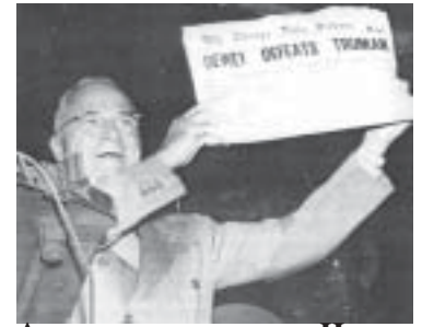
A FAMOUS PICTURE OF HARRY TRUMAN HOLDING THE PAPER DECLARING DEWEY THE WINNER.