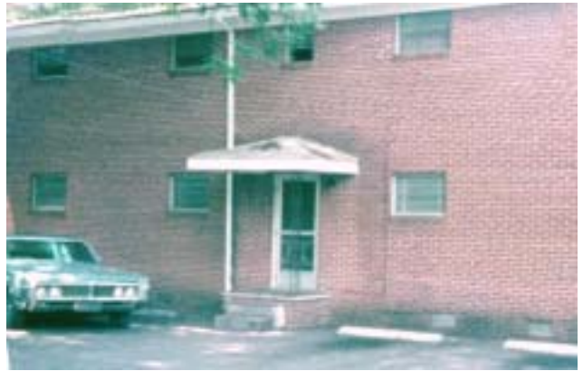
THE APARTMENT BUILDING AT WALKER AVENUE IN HUNTSVILLE. THE MAIN ENTRANCE WAS A NARROW DOOR THAT OPENED INTO A DARK HALL THE APARTMENTS WERE ALSO SMALL AND DARK AS THE TREES SHADED THE VERY SMALL AND NARROW WINDOWS