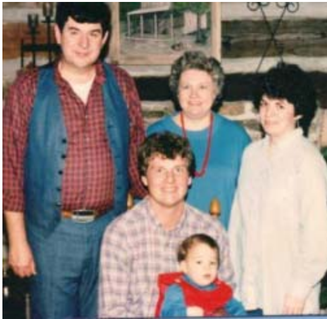
PROUD PARENTS AND GRANDPARENTS