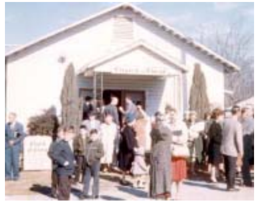
THE CHURCH BUILDING AT GURLEY IN 1960