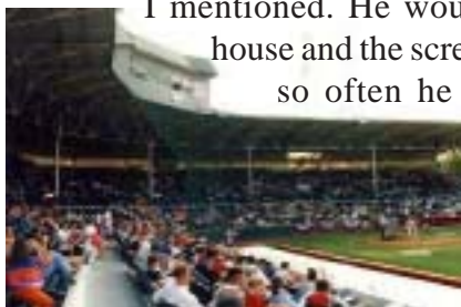
ENGLE STADIUM - 1955

I remember daddy coming home from work with the person he rode with and getting out of the car with his lunch box. Daddy would lead the singing at church and make us things in the basement to play with, like the doll beds