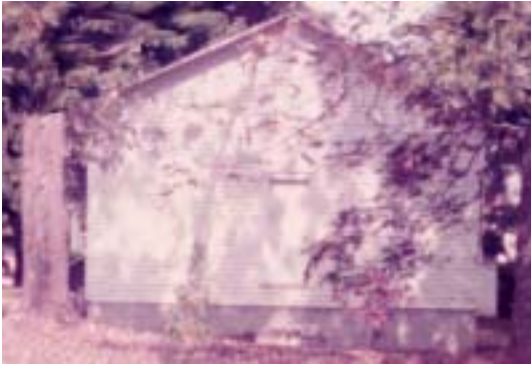
THE CHURCH BUILDING AT PAINT ROCK NO LONGER EXISTS AS THE FOUR LANE HIGHWAY REMOVED IT A FEW YEARS AGO. THE MEMBERS BEGAN ATTENDING AT THE LOCAL CONGREGATIONS AT GURLEY AND WOODVILLE.