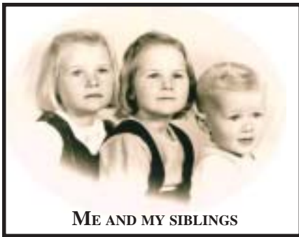
ME AND MY SIBLINGS