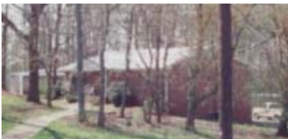
THE PREACHER’S HOUSE AT WOODSTOCK. PRIOR TO OUR LIVING THERE IT HOUSED THE OFFICES.

We were given the choice as to where we would live. There were several options, which included renting or buying. We also could live in the house next door, which the church had purchased a few years before and used it for offices and youth activities. The elders decided to move the offices back to the church building, so the house was available for us to live in. As we did not wish to purchase a house, we looked around for apartments and finding none. We decided to live in the house next door to the church building. The men painted and Leroy laid the carpet.