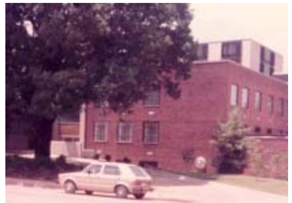
HUNTSVILLE HOSPITAL IN HUNTSVILLE, ALABAMA