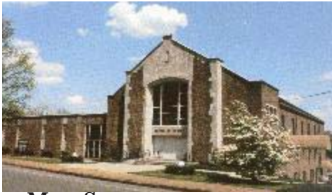
MAIN STREET CHURCH BUILDING 322 N. MAIN STREET