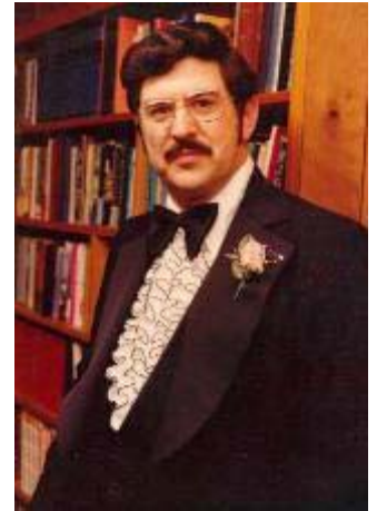
NOW YOU SEE IT.....