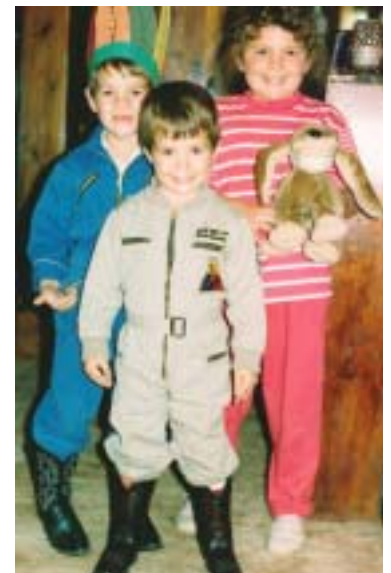
ONE LITTLE, TWO LITTLE, THREE LITTLE.....